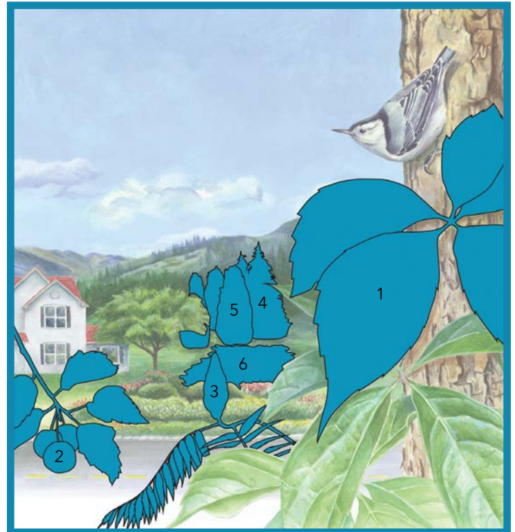
Plants shown on front cover